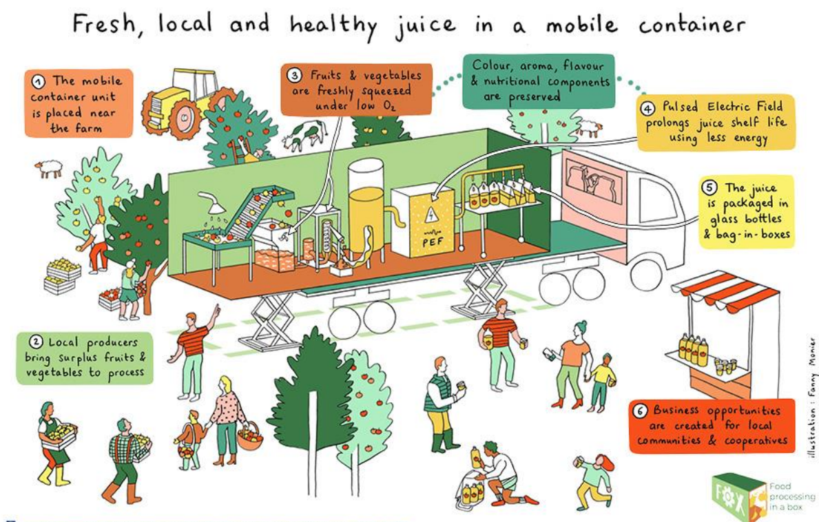
Figure 2. Illustration of the different phases of juice production within the FOX project.

A small-scale, mobile, and flexible fruit processing unit has been developed by integrating scaled-down technologies to ensure ease of use across various locations, raw materials, and final product specifications. The FOX mobile unit is specifically designed for extracting fruit juices and purees in an oxygen-reduced environment. This innovative extraction system is coupled to a gentle preservation - Pulsed Electric Field (PEF), ensuring improved quality while offering maximum flexibility for a wide range of applications.