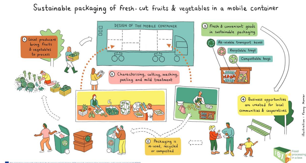
Figure 5. Illustration of the different phases of sustainable food packaging production within the FOX project.

A sustainable packaging system for fresh fruits and vegetables snacks was developed within FOX project. The system adapts to the quality of raw materials, using minimal processing and small-scale packaging units. The secondary packaging is made of a new biocomposite with recycled cork. The quality of fresh fruits and vegetables and new sustainable packaging systems (primary and secondary) for the preservation and distribution of fresh fruit and vegetable snacks that are produced are analyzed and packed in small-scale and mobile units.