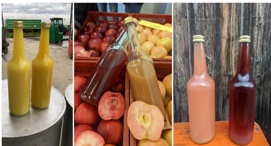
Figure 3. Example of some of the fruit juices obtained from the FOX mobile container.